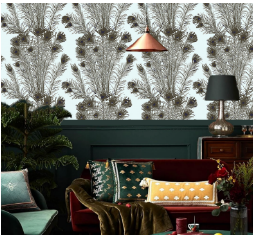
'Peacock Feathers' - Insitu