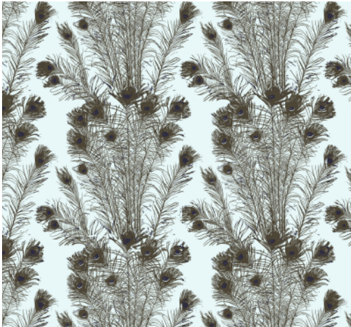
'Peacock Feathers' - Mint