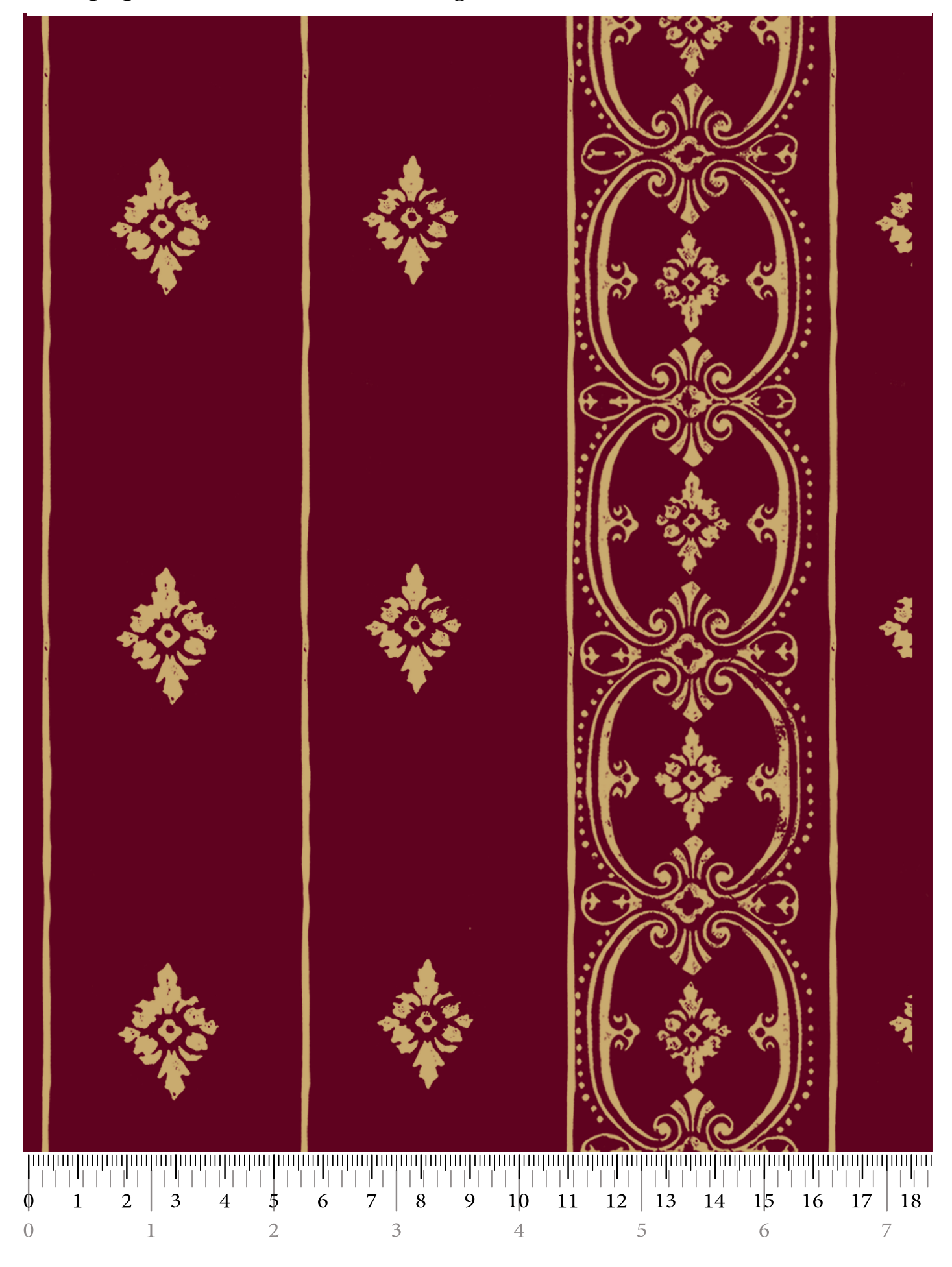
'Fleur Diamont' Bordeaux with Vertical Border Wallpaper from Collette Dinnigan