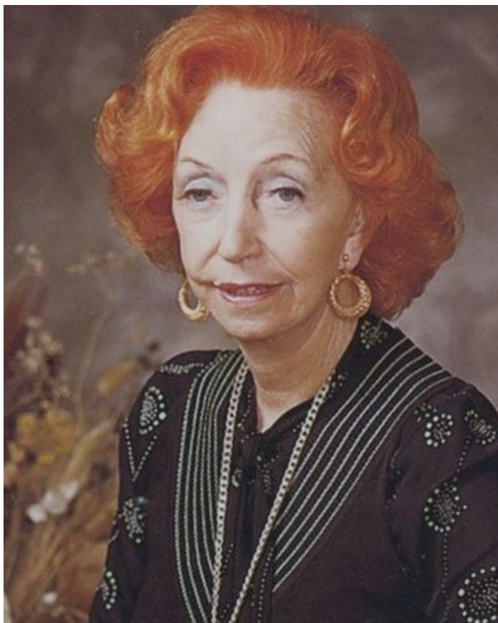
Florence Broadhurst Image Courtesy of Robert Lloyd-Lewis, 1974